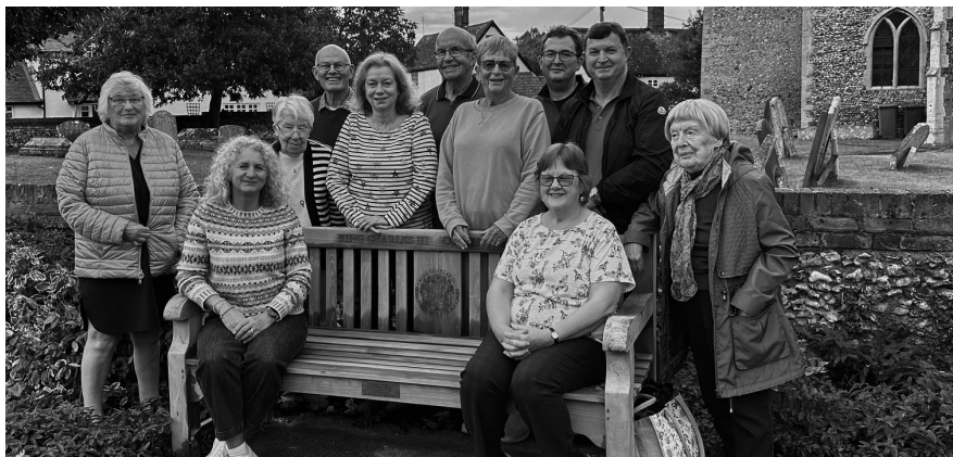
Photograph of members of the WI, the CC, the PC, & the PCC, who all contributed to the new bench.

As you will have noticed by now, a new bench has replaced the old one between the church wall and the village sign.